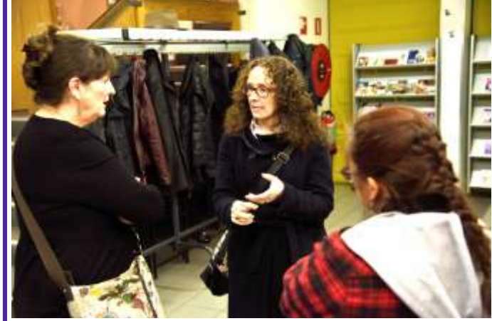
The Chairman/Producer BLOCBusters is interviewed for FM Brussels

Here is the link: <a href="http://dekam.be/en/newsletter">http://dekam.be/en/newsletter</a>